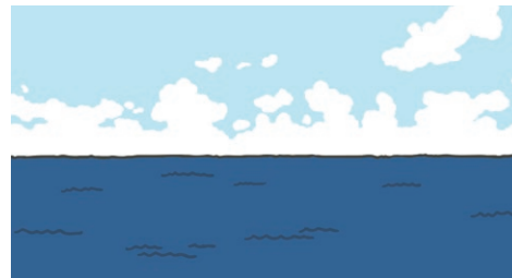
sea or ocean